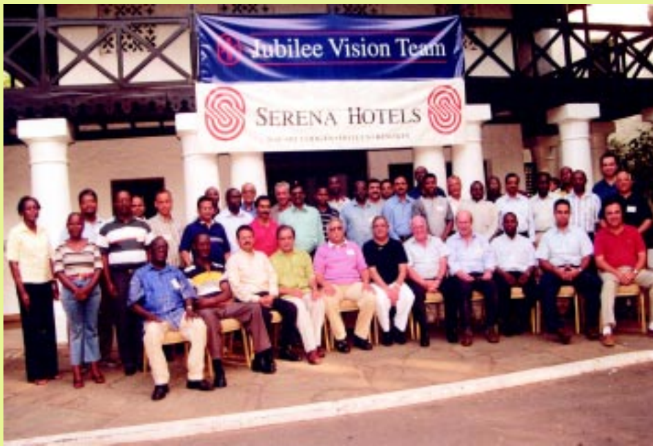
Members of The Jubilee Insurance Vision Team at the Serena Beach Hotel, Mombasa.