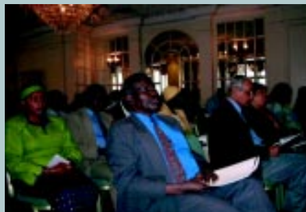
Shareholders keenly following the proceedings of the meeting.