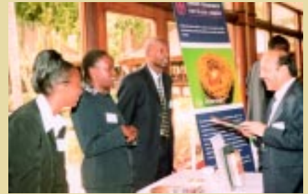
Jubilee staff at hand to explain the features of various General and Life products offered by the Company to participants attending the convention.

The event had over seventy participants from the regulatory, fiscal, legal and monetary authorities of the three East African countries, to deliberate on the leasing model that will work for East Africa. Uganda Leasing Association had organized the convention together with the sponsoring companies, The Jubilee Insurance Company Limited, Afro Lease, Development Outcomes Limited, DFCU, East African Development Bank, International Finance Corporation and NIC Bank.