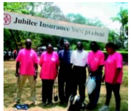
Jubilee participants after the walk.

On Saturday 18th September, 2004, Jubilee sponsored a team of 10 participants to support the worthy cause of caring for the terminally ill, initiated by the Nairobi Hospice and Kencell.